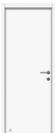
1LK | Branco White Blanc