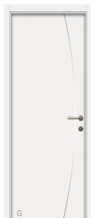
VENICE | Branco White Blanc