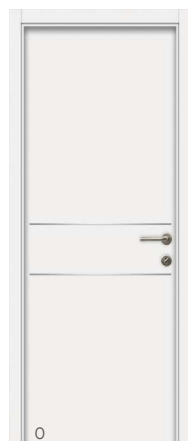
MILAN | Branco White Blanc