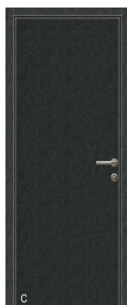
1LK | Preto craquelé Black "craquelé" Noir craquelé