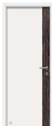
ROME | Branco (41) White (41) Blanc (41)