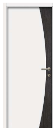
VIENNA | Branco (38) White (38) Blanc (38)