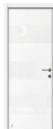
LISBON | Branco (60) White (60) Blanc (60)