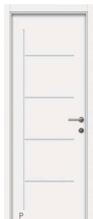
EVO | Branco White Blanc