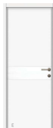
LONDON | Branco (60) White (60) Blanc (60)