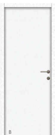
1LK | Branco craquelé White "craquelé" Blanc craquelé