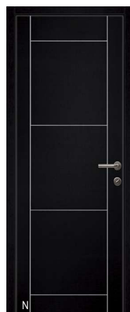
BERLIN | Preto Black Noir