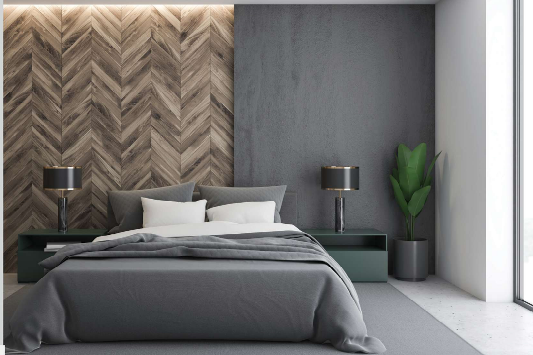
MONACO Branco | White | Blanc