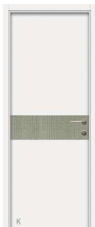
ABU DHABI | Branco (69) White (69) Blanc (69)