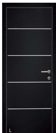
ANKARA | Preto Black Noir