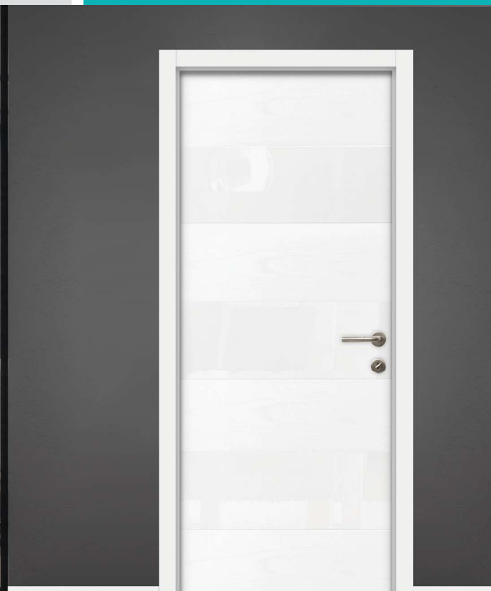
LISBON Branco | White | Blanc