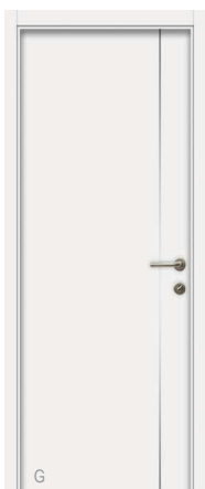
MADRID | Branco White Blanc