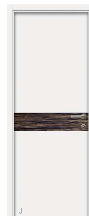
MONACO | Branco (41) White (41) Blanc (41)

Nota: Os modelos apresentados estão disponíveis em várias cores e opções decorativas, consulte as páginas 18 e 19.