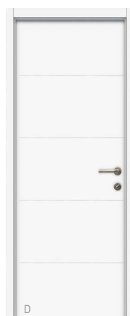
PARIS | Branco White Blanc