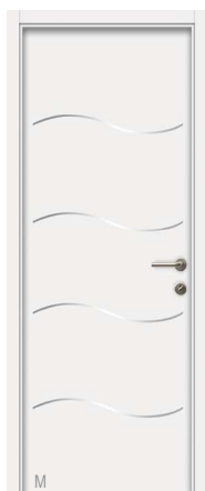
RIO | Branco White Blanc